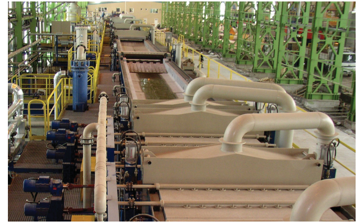
Fig 3 Turbulent shallow tank for pickling with HCl

ne 2 are: H R Low C Steel 1.2 – 6.0 1050 – 2350