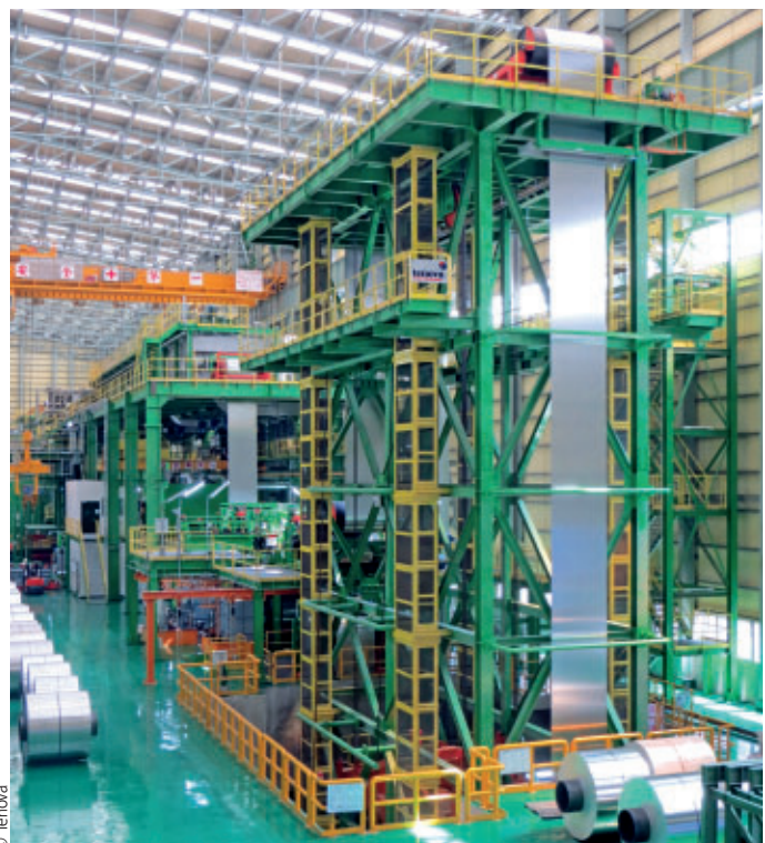
Continuous annealing line from Tenova

In the past few years Tenova Strip Processing has benefited from the global demand for automotive strip production lines. The company experienced a boom of sales in continuous annealing and surface pre-treatment lines from noted aluminium producers in Europe, North America and Asia to cover not only automotive but also aviation, architectural and various other market demands. This order boom and the overall technological aspects of these new processing lines were reported in ALUMINIUM 4/2014.